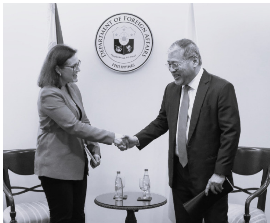
Dr. Claudia Mahler, UN Independent Expert (left) and Secretary for Foreign Affairs Enrique A. Manalo (right) discuss the Philippines’ role as champion in promoting rights of older persons

(From page 1) motion and protection of rights of older persons was the Commission on Human Rights of the Philippines, the National Human Rights Commission of Korea, and the Asia-Pacific Forum of National Human Rights Institutions. Secretary Manalo noted the workshop was a good practice to garner wider support for the protection and protection of rights of older persons was a “gathering point” for the international community to work and unite on. He underscored that “there should be more awareness not only of the human rights of older persons, but of their contributions to society.” Both Secretary Manalo and Dr. Mahler agreed that the issue of